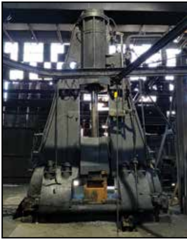
DOFASCO 10,000-lb. Air Drop Forging Hammer