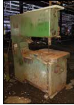
GROB 36" Vertical Band Saw