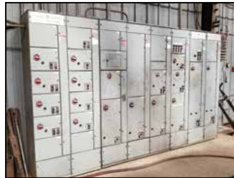
GENERAL ELECTRIC Master Control Center