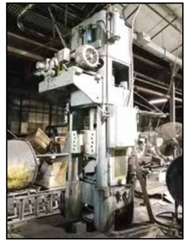
HPM 400-Ton Straight-Side Hydraulic Press