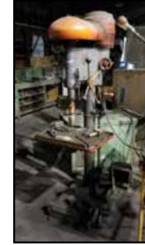
SIBLEY 24" Drill Press