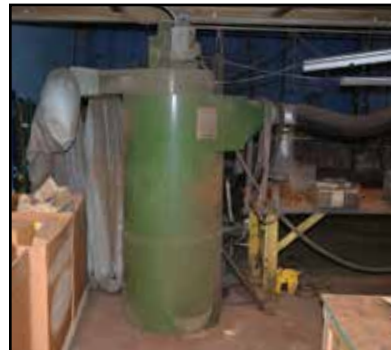
HAMMOND MFG. DusKolector Dust Collector