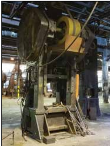
MINSTER 200-Ton Single Point Straight-Side Press