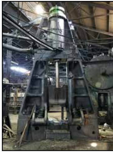
CHAMBERSBURG 8,000-lb. Air Drop Forging Hammer