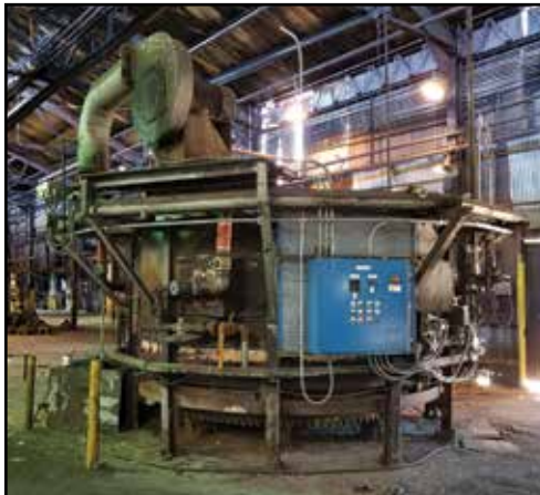
(16) Gas Fired Slot, Hearth & Fire Box Furnaces