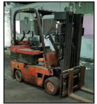
CATERPILLAR TC60D 6,000-lb. Forklift