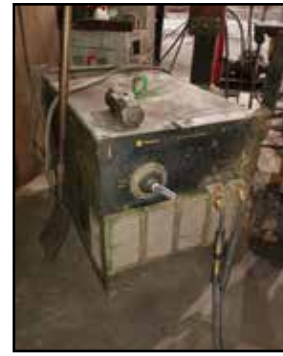
WESTINGHOUSE 750-AMP Arc Welder