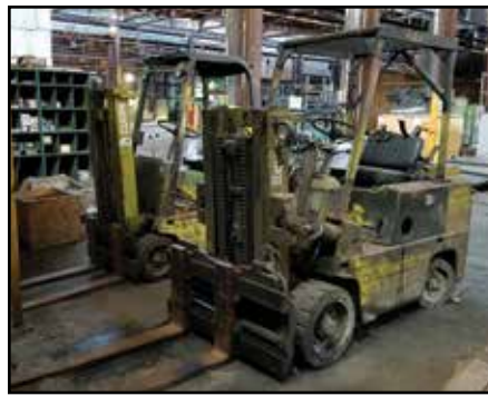
CATERPILLAR 8,000-lb. Forklift