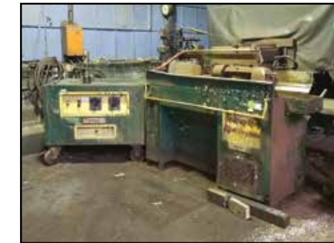
MAGNAFLUX Fluorescent Penetrant Inspection System

DROTT Go-Devil 8,500-lb. Carry Deck Crane , Model 85RM2, S/N 1005, 3-Stage Telescoping Boom, up to 1,200-lb. @ 16', Solid Yard Tires, Gas Powered (out of service)