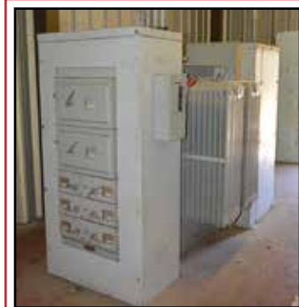
GENERAL ELECTRIC 7700 Line Motor Control Center