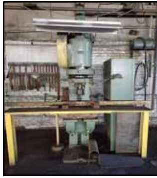
GENERAL MFG. 75-Ton Adj. Bed Horn Press