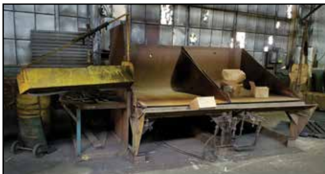
(2) TROFF Hydraulic Dump Tables