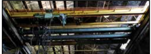
AMCO 10-Ton x 37' Span Double Girder Top-Running Bridge Crane