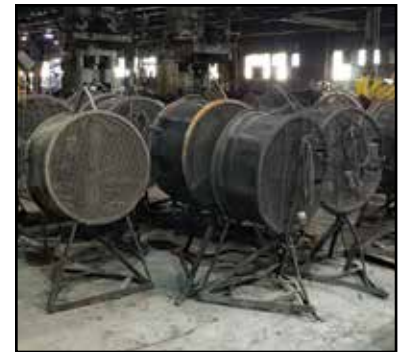
(50+/-) 24"-36" Shop Fans