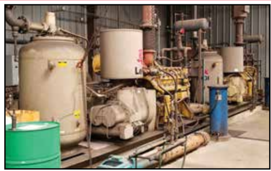
(4) LEROI 600-HP Gas Powered Rotary Screw Air Compressors w/CAT 3412 NG 600+ HP Engines