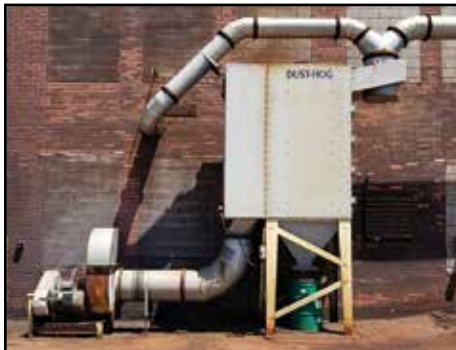
UNITED AIR SPECIALISTS Dust Hog Dust Collector