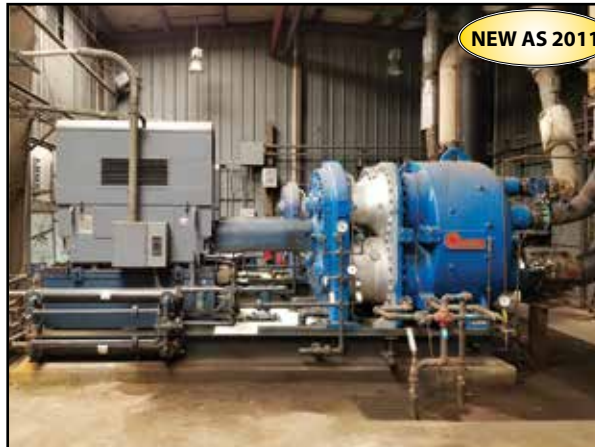
(2) INGERSOLL RAND Centac 2,250-HP Centrifugal Air Compressors