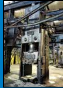
(20) Straight-Sided Presses to 1,000-Ton