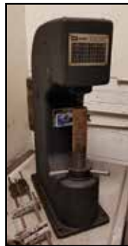
ACCO WILSON Brinell Hardness Tester