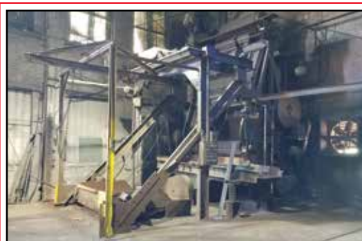
WHEELABRATOR Tumblast 7-Cubic Foot Shot Blast Machine