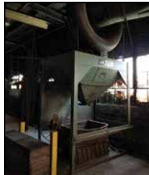
AAF INTERNATIONAL Rota-Clone Dust Collector