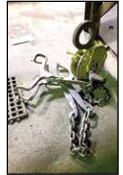
Horizontal & Vertical Plate Clamps