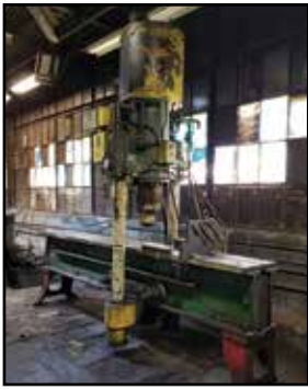
HPM 150-Ton Traveling Head 2-Post Axle Press