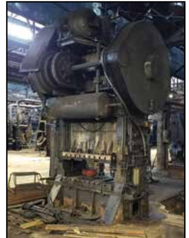
CLEARING 200-Ton 2-Point Straight-Side Press