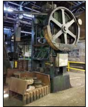
(20) TOLEDO, MINSTER, HPM, BLISS & CLEARING SS Hydraulic, Double & Single Crank Presses to 1,000-Ton