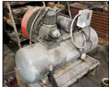
5-HP Reciprocating Air Compressor