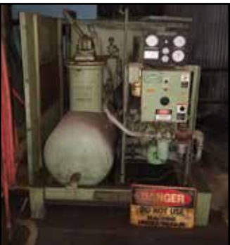
SULLAIR 125-HP Rotary Screw Air Compressor