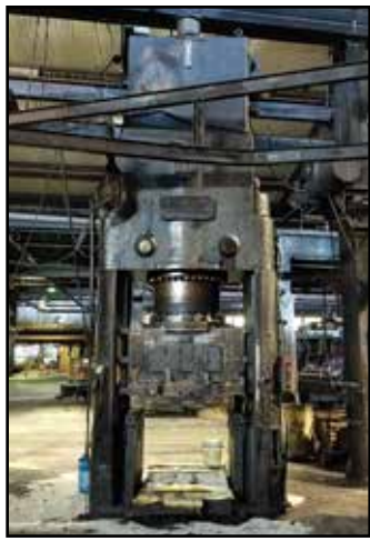
HPM 1,000-Ton Straight-Side Hydraulic Press