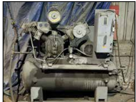
INGERSOLL RAND 10-HP Reciprocating Air Compressor