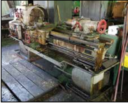
HENDEY 16" x 54" Geared Head Engine Lathe