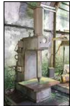
DETROIT TESTING PHL-2 Brinell Hardness Tester