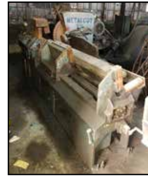
METALCUT Model XII Automatic Cold Saw