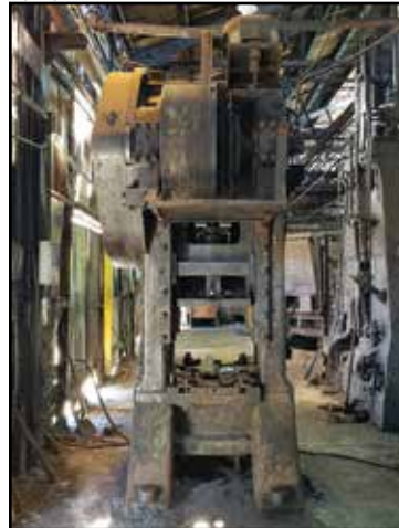
MINSTER 160-Ton Back Geared Straight-Side Single Crank Press