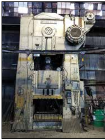
BLISS 600-Ton Single Point Eccentric Geared Straight-Side Press