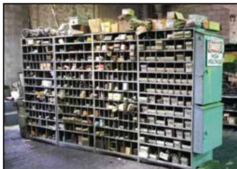
Large Inventory Repair/Shop Parts – Bulbs, Wire, Hardware, Fuses, Valves & More