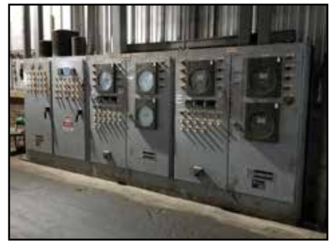
Heat Treat Line - (2) ELECTRIC FURNACE CO. 52'W x 30'L x 12"H Natural Gas Fired Pusher Furnaces