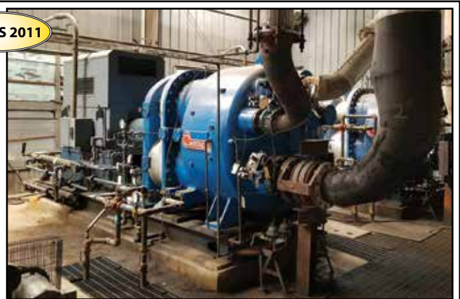
(2) INGERSOLL RAND Centac 3C 90AE4 & 3C 90M4 2,250-HP Centrifugal Air Compressors