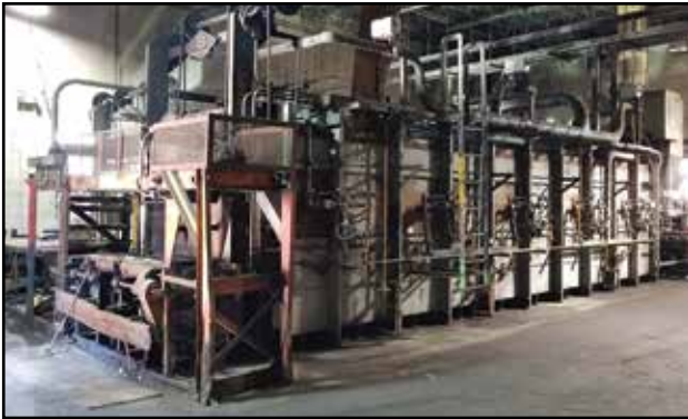
Heat Treat Line - (2) ELECTRIC FURNACE CO. Pusher Furnaces

INSPECTION: Day Prior to Auction from 9AM - 4PM