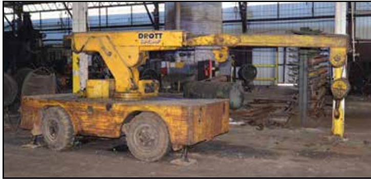
DROTT Go-Devil 8,500-lb. Carry Deck Crane