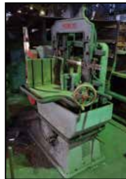
PEERLESS 10" x 12" Power Hack Saw