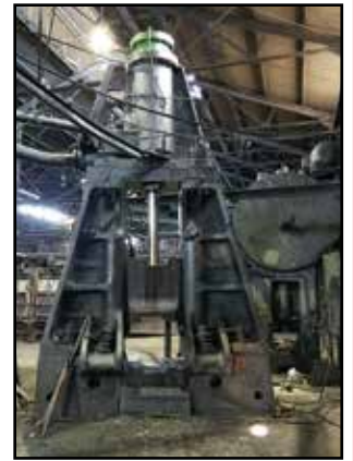
(20+/-) ERIE, DOFASCO & CHAMBERSBURG Air Drop Forging Hammers to 16,000-lb.