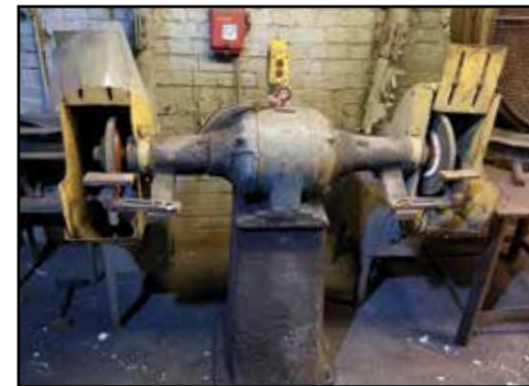
14" Heavy Duty Pedestal Grinder