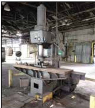
OILGEAR 50-Ton C-Frame Hyd. Straightening Press