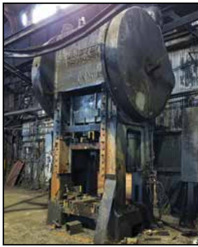
MINSTER 400-Ton Single Point Straight-Side Press