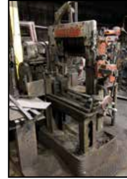
PEERLESS 11" x 14" Power Hack Saw