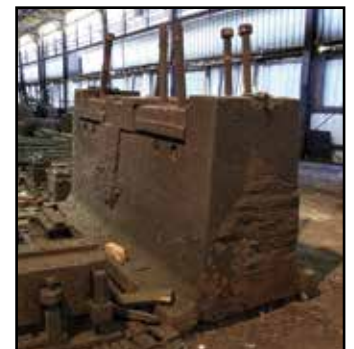
ERIE 5,000-lb. Anvil