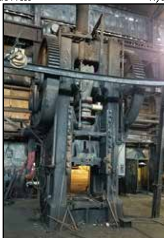
TOLEDO 600-Ton Straight-Side Double Crank Press