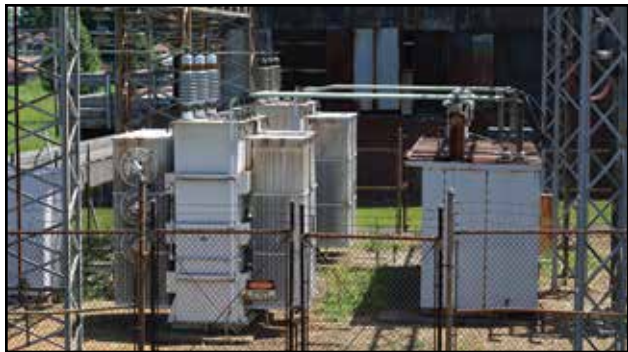
96,000 KVA Electrical Substation