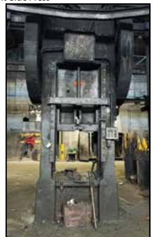
BLISS 250-Ton Straight-Side Double Crank Press

Stroke BLISS 125-Ton (Est) Single Crank Press , Model 66-1/3, S/N 408, 24" x 30" Bed MINSTER 75-Ton Back Geared Single Crank Press , 22" x 38" Bed, 5" Stroke