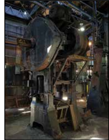
MINSTER 175-Ton Back Geared Straight-Side Single Crank Press