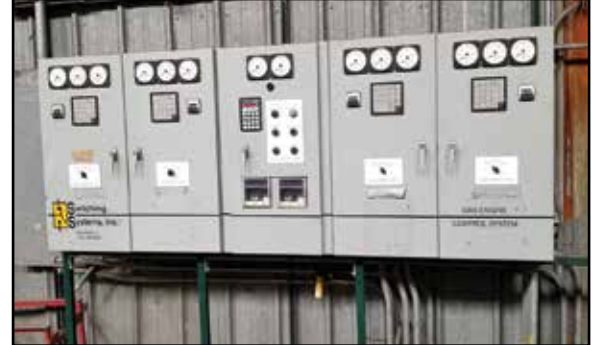
5-Panel Switching Systems Gas Engine Control System