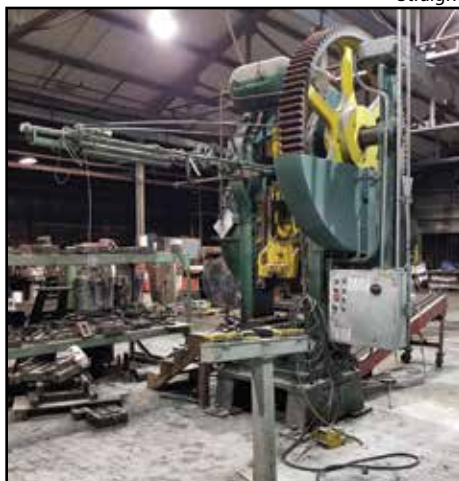
BLISS 125-Ton (Est) Straight-Side Single Crank Press