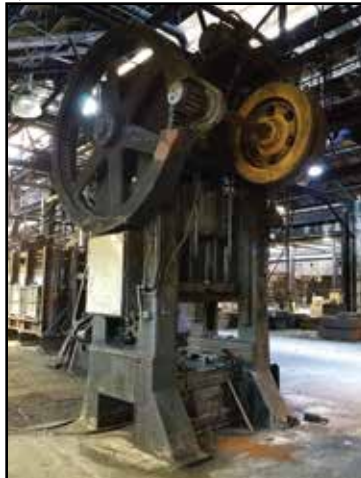
BLISS 250-Ton 2-Point Straight-Side Press