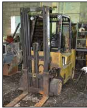
HYSTER FDRK 5 8,500-lb. Forklift