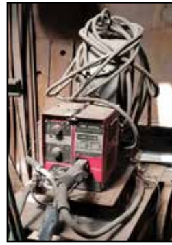
LINCOLN 600-AMP Arc Welder