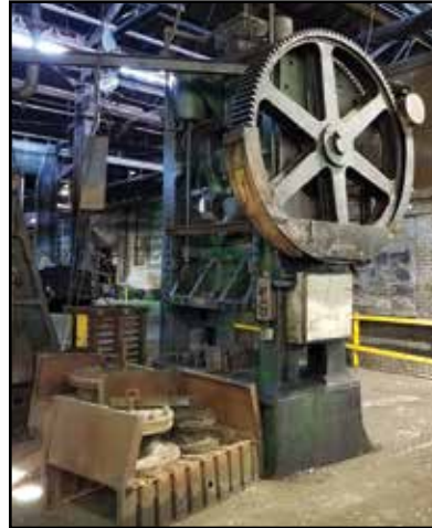
TOLEDO 200-Ton Straight-Side Single Crank Press