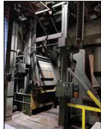
(3) WHEELABRATOR & PANGBORN Shot Blast Machines