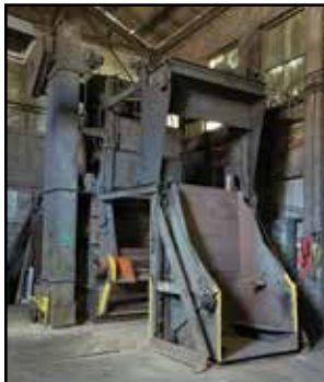
PANGBORN 26-Cubic Foot Shot Blast Machine