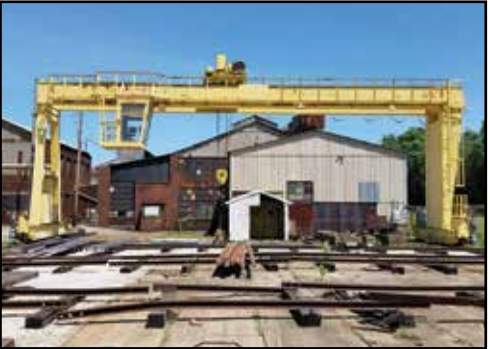
ALLIANCE MACHINE 15-Ton x 62' Rail-Mounted Gantry Crane