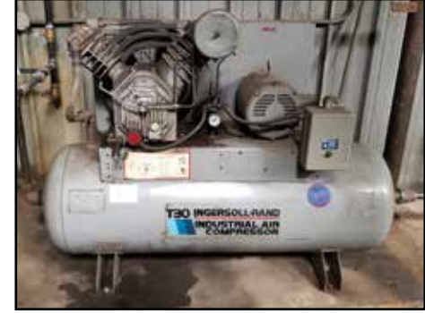
INGERSOLL RAND T30 Reciprocating Air Compressor