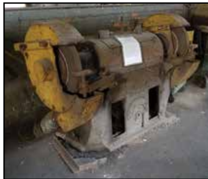
24" Heavy Duty Pedestal Grinder