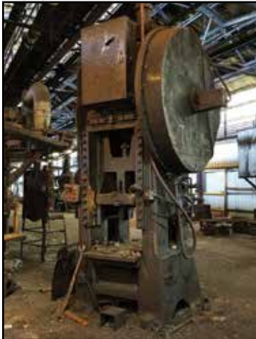
MINSTER 165-Ton Back Geared Straight-Side Single Crank Press