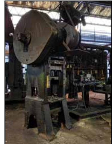
MINSTER 75-Ton Back Geared Straight-Side Single Crank Press