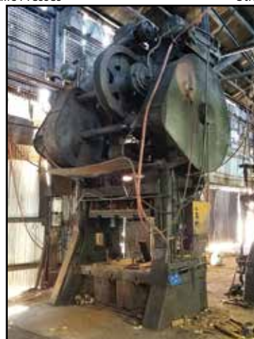
BLISS 200-Ton Straight-Side Double Crank Press