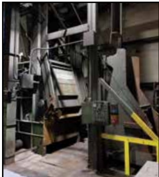
WHEELABRATOR Tumblast 34-Cubic Foot Shot Blast Machine