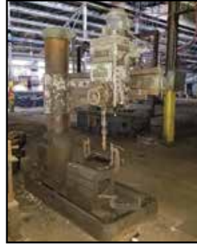
IKEDA 4' x 13" Column Radial Drill