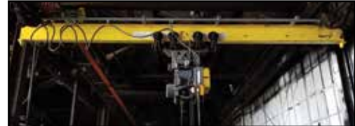
CLEVELAND Tramrail 3-Ton x 15' Span Single Girder Bridge Crane