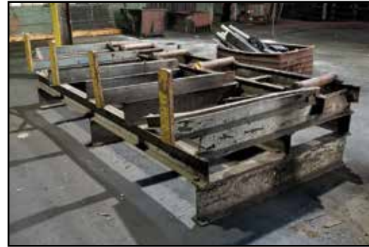
Electric Steel Roller Conveyor Lift System