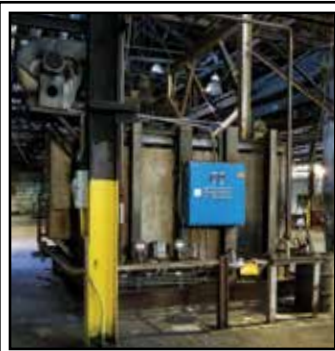
3' x 9' x 2'H 2-Door Gas Fired Box Furnace