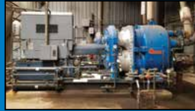
(2) IR Centac 2,250-HP Air Compressors, New as 2011