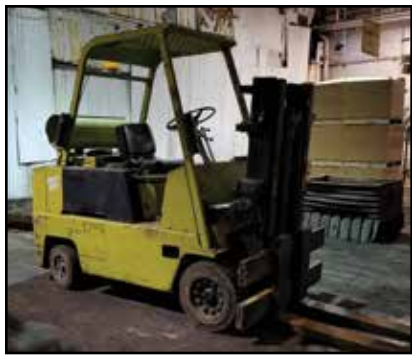
CLARK C500-100 10,000-lb. Forklift