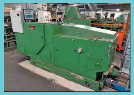
(1) 1/4" Nakashimada Model H20GSP DSSD Long Stroke Cold Header