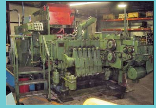
**(1) 3/4" National Model 750 6-Die Cold Former

75 PPM (1) 1/2" Waterbury Farrel Model #4 2-Die 4-Blow Universal Transfer Header; 1/2" Max Cutoff Diameter, 3-3/4" Max Transferable Length, 5-1/4" Max Cutoff Length, 70 PPM, 125-185 Heading Tonnage, 1-PPM, 125-185 Heating round , Station / Combined Tonnage SEE PHOTO