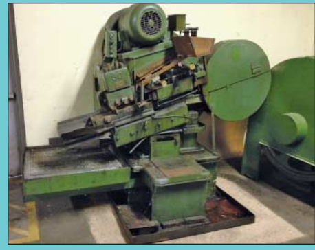
*(1) 1/2" Waterbury Farrel Model #30 Side Feed Thread Roller

Shop and Support Equipment Consisting Of; Milwaukee Mag Base Drill, (8) Vidmar And Lista Multi-Drawer Tooling Cabinets, Electric and with Vises, Pedestal Fans, Shop Ladders, Personnel Lockers, Cantilever Storage Racks, Steel Shelving, (2) 1,000 Lb. CM Electric Hoists, (8) Sections 42" X 100' °CM X 12' High HD Steel Front Storage Rack, Roller Conveyor