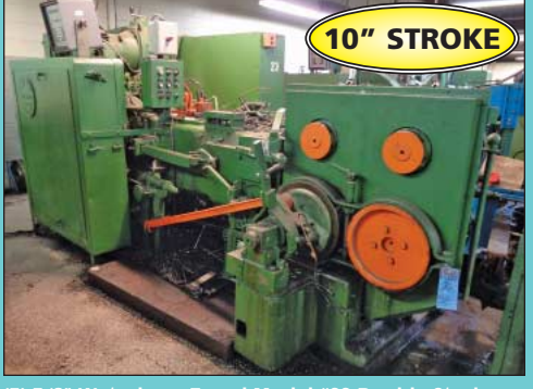
(3) 3/8" Waterbury Farrel Model #22 Double Stroke Open Die Super Long Stroke Cold Headers