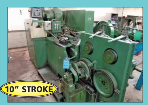
(3) 3/8" Waterbury Farrel Model #22 Double Stroke Open Die Super Long Stroke Cold Headers