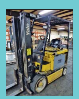
ERC050 Electric Lift Truck