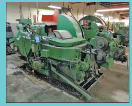
(1) 1/2" National 3-Die Progressive Header