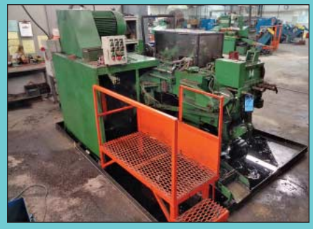
(1) 1/2" Waterbury Farrel Model #4 2-Die 4-Blow Universal Transfer Header