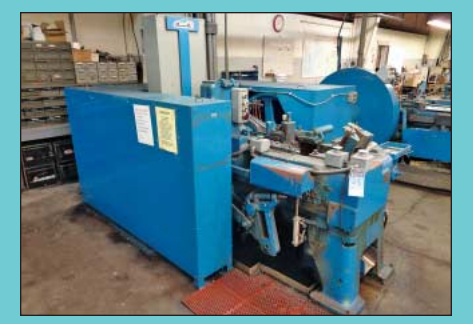
**(2) 5/16" Waterbury Farrel Model #11 DSOD Hand Feed Open Die Single Stroke Reheaders