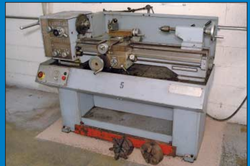
10" X 36" Clausing Geared Head Engine Lathe

Other Inspection Tools and Equipment Consisting of; Height Gauges, Dial Gauges, Micrometers, Pin Gauges, Granite Surface Plates and Other Related Tools