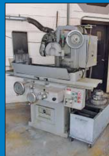
12" X 24" Gallmeyer and Livingston Model 370 Hydraulic Surface Grinder