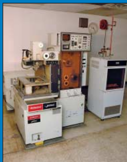
JapaX Bridgeport Model LV3B Wire Cut EDM