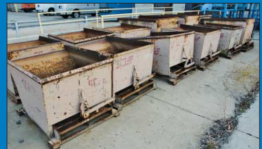
(20) Various Size Self Dumping Hoppers