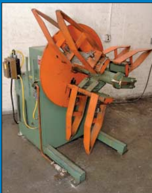
6,000 Lb. Air Feeds Inc. Model R60 Reel