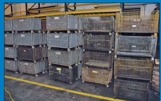
(150) 20" X 32" X 14" Deep Collapsible/Stackable Wire Baskets