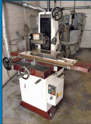
6" X 18" Chevalier Model FSG-618M Hand Feed Surface Grinder