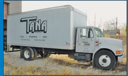
1998 International Model 4900DT466E Single Axle Van Body Truck