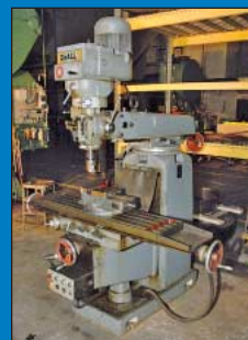
3 HP DoAll Model 80-2342 Variable Speed Vertical Mill