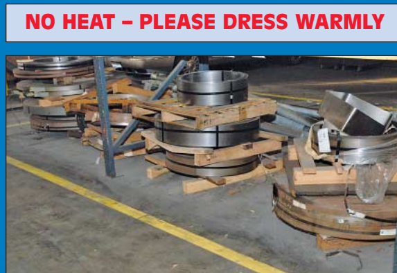
Approx. 20 Ton Assorted Gauge and Width Steel Coils