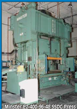
Minster E2-400-96-48 SSDC Press

2020 DUNLAP ST., CINCINNATI, OHIO 45214 PHONE (513) 241-9701 / FAX (513) 241-6760 WEBSITE: cia-auction.com