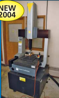
Brown & Sharpe Model Micro Excel PFX 4-5-4 Coordinate Measuring Machine