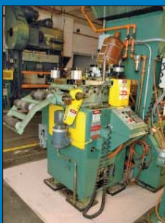
12" X .156" Air Feeds Inc. Model DRFS3 Combination Servo Feed and Straightener