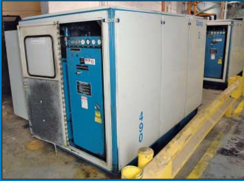
(2) 100 HP Quincy Model QSI-490 Cabinet Enclosed Rotary Screw Air Compressors