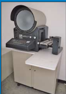
Optical Gaging Products Model Opticum Qualifier 14B Di-Metric Plus Vision Computer Optical Comparator