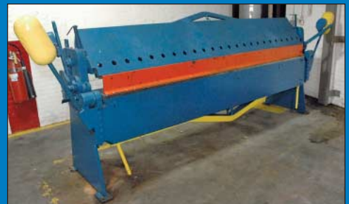
10' Chicago Size 10 Hand Bending Brake