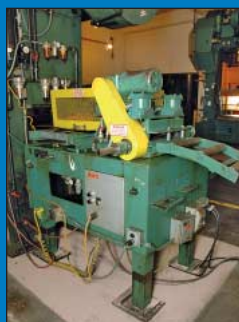
(2) 12" X 12" X .156" COE Model CF325 Air Feeds