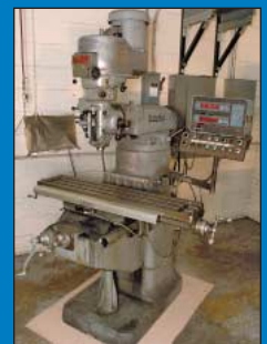
2 HP Bridgeport Series I Variable Speed Vertical Mill