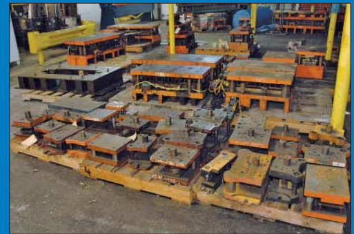
(135) Heavy Stamping Dies from 1' X 1' to 3' X 6' in Size