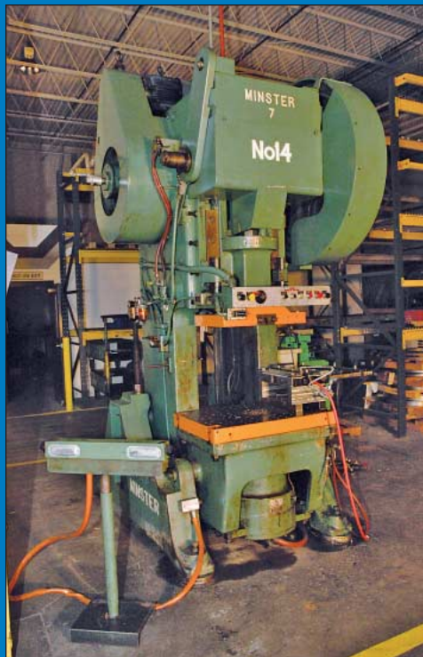
75 Ton Minster Model 7 OBI Press

(2) 2,000 Lb. Bench Master Model 515 Coil Cradles; S/N 46313 & 34561, 15" Wide, Motorized