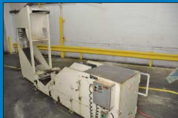
(3) 6,000 Lb. COE Model CPCC6018 Coil Cradles