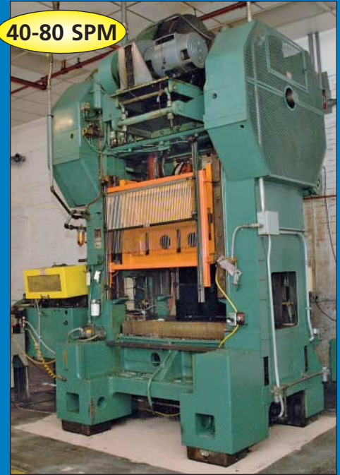
150 Ton L&J Model EM2-150-30-48 Straight Side Double Crank Press