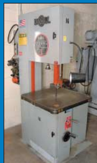
20" DoAll Model 2013-V Vertical Band Saw