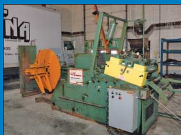
COE Combination Straightener, Cradle and Uncoiler