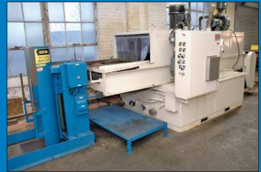
Final Stage Model 5-36 Electric Fired Mesh Belt Parts Washer

15% Onsite Buyers Premium 18% Online Buyers Premium