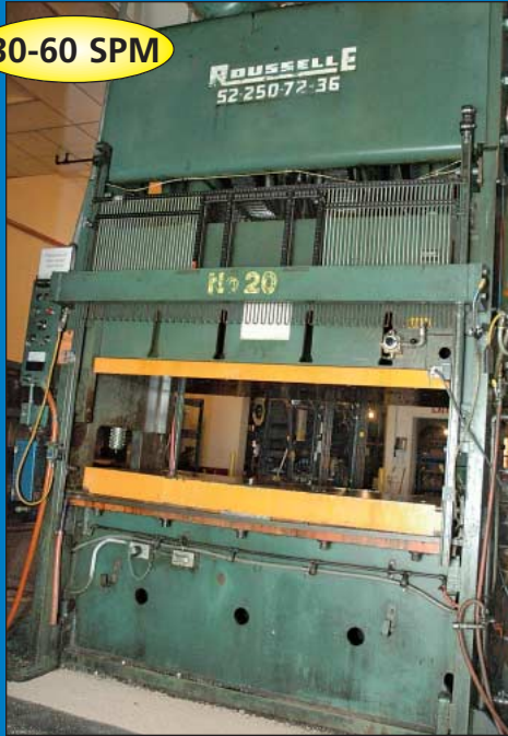
250 Ton Roussele Model S2-250-72-36 Straight Side Double Crank Press