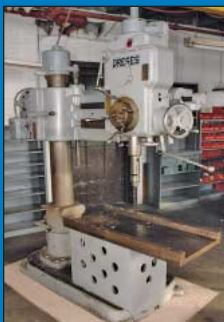
4' Arm X 9" Col. Drees Radial Arm Drill