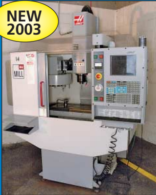
Haas Model Mini-Mill CNC Vertical Machining Center