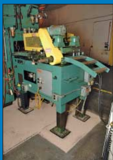
(2) 12" X 12" X .156" COE Model CF325 Air Feeds