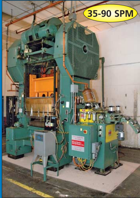
150 Ton L&J Model EM2-150-30-48 Straight Side Double Crank Press