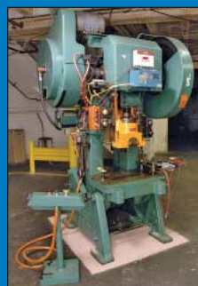
60 Ton L&J Model 60 OBI Press