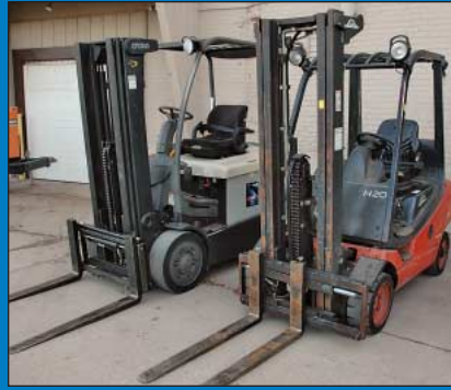
Late Model Crown Electric and Baker LP Lift Trucks