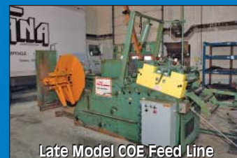
Late Model COE Feed Line