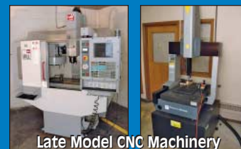
Late Model CNC Machinery