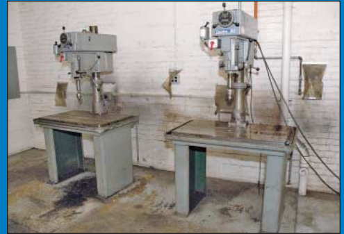
(2) 20" Clausing Model 2286 Single Spindle Production Table Drills