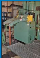
24" Wide COE Model CPRF-5424 Servo Feed