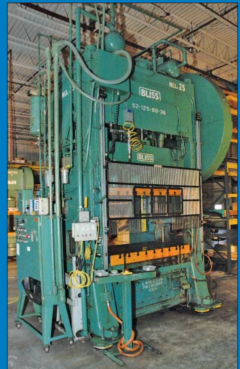
125 Ton Bliss Model S2-125-60-36 Straight Side Double Crank Press