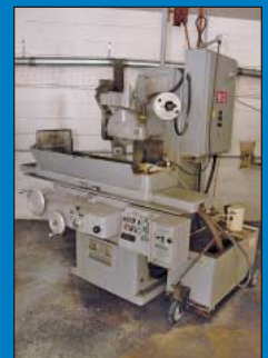
12" X 24" Gallmeyer and Livingston Model 373 Hydraulic Surface Grinder