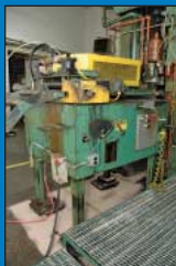
18" X 18" X .125" COE Model CF325 Air Feed