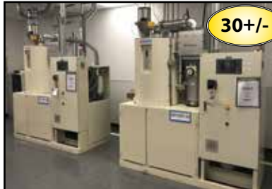
(30+/-) KAWATA Dryers