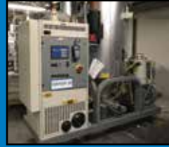
(40+) IPIOVAN & KAWATA Dryers