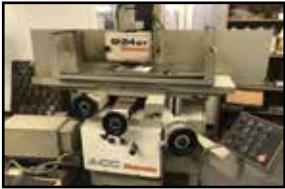
OKAMOTO Surface Grinder