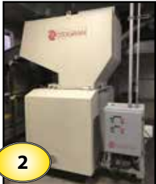
(2) ROTOGRAN WO-2236-SP Granulators