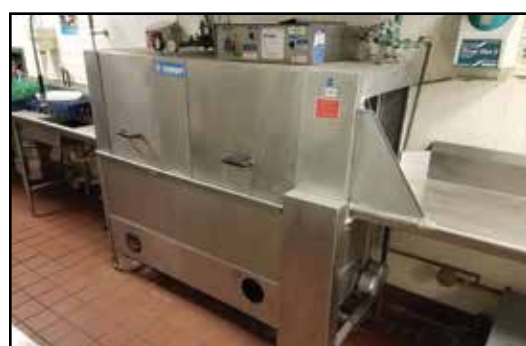
INSINGER Rack Conveyor Warewasher