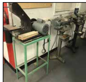
Several Grinding/Sanding Stations