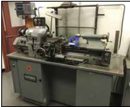
HARDINGE HLV-H Dovetail Bed Lathe