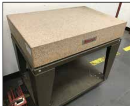
STARRETT Granite Surface Plates