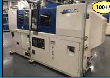
(100+/-) MEIKI & SUMITOMO CNC Plastic Injection Molding Machines