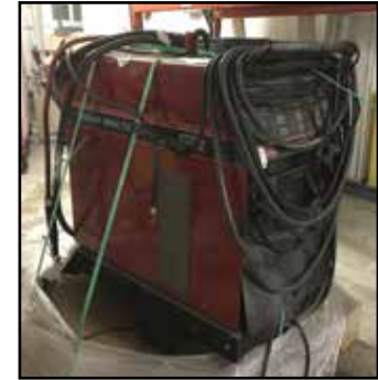
LINCOLN TIG 255 Welding Supply