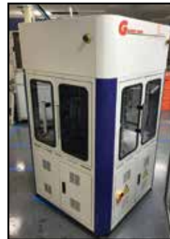
GUANN YINN Code Verification System