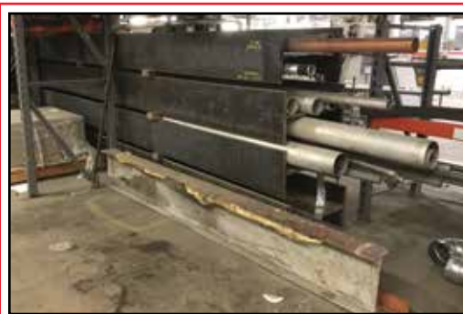
Steel I-Beams, Copper & Stainless Steel Piping