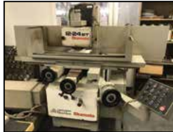
OKAMOTO 12" x 24" Rotary Surface Grinder