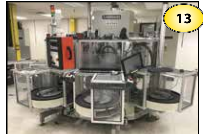
(13) KAMMANN 4-Color Screen Printers