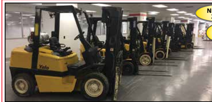
(29) TOYOTA, YALE & HYSTER Forklifts From 3,000-lb. - 15,500-lb. Capacity, New As 2012