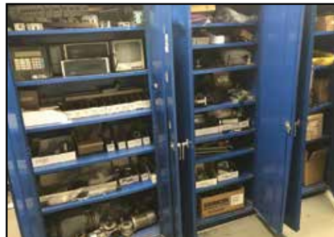
Cabinets Full of Miscellaneous Spare Parts and Other Items

UNABLE TO ATTEND? BID ONLINE IN REAL TIME AT WWW.BIDSPOTTER.COM