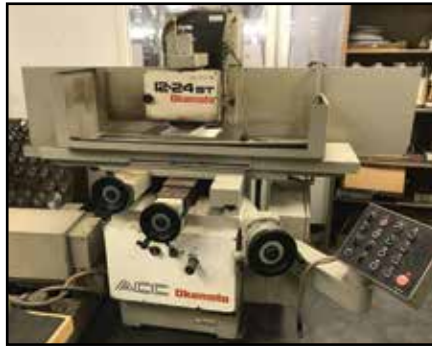
OKAMOTO 12" x 24" Rotary Surface Grinder