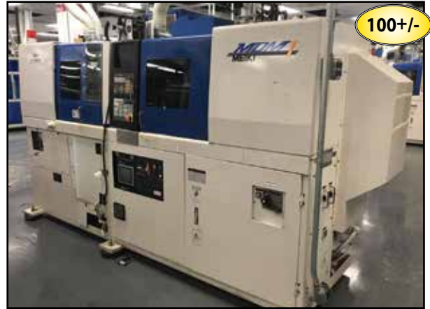
(100+/-) MEIKI & SUMITOMO CNC Plastic Injection Molding Machines

INSPECTION: DAY PRIOR TO AUCTION FROM 9AM - 4PM