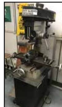
JET Drill Press