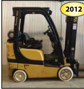
YALE 4,000-lb. Forklift