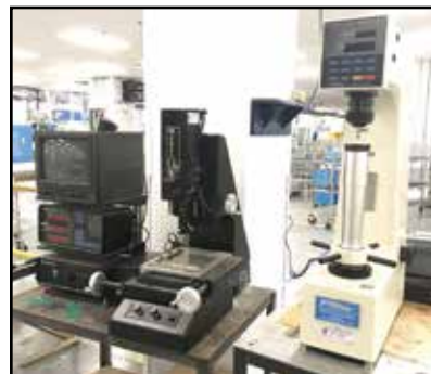
Large Assortment Inspection Equipment