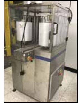
BRONWAY Packaging Tunnel