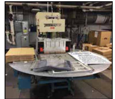
Theratron Rotary Heat Sealer