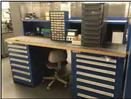
LYON Work Benches