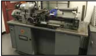
HARDINGE HLV-H Lathe