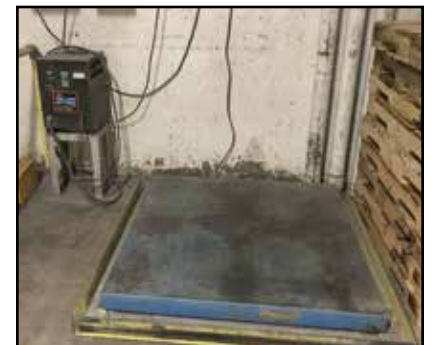
METTLER TOLEDO Digital Scales