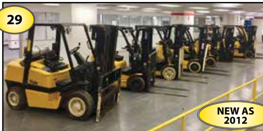
(29) TOYOTA, YALE & HYSTER Forklifts From 3,000-lb. - 15,500-lb. Capacity, New As 2012