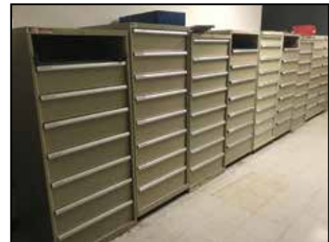
Several VIDMAR, LYON & VISTA Cabinets