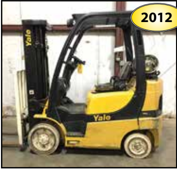
YALE 6,000-lb. Forklift