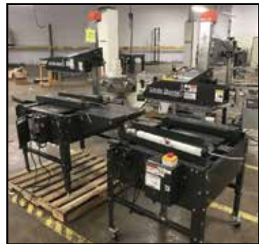
LITTLE DAVID Case Sealers