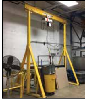
1-Ton Free-Standing Gantry System