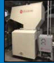
(2) ROTOGRAN WO-2236-SP Granulators