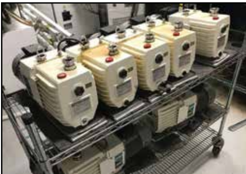
Tremendous Number of Motorized Pumps