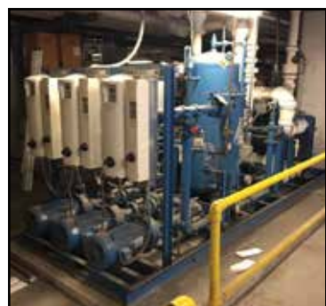
Skid-Mounted DI Water Pumping Stations