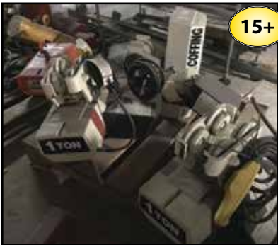
(15+) COFFING 1-Ton Electric Hoists