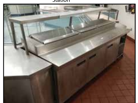
Stainless Steel Prep Table