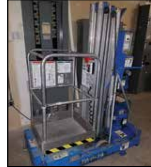
GENIE 350-lb. Manlift