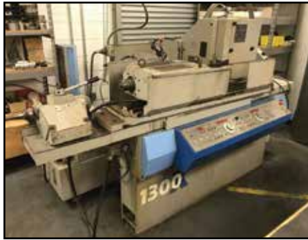
JONES & SHIPMAN 1300X CNC Grinder