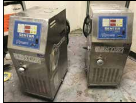
ADVANTAGE Sentra Temperature Control Units