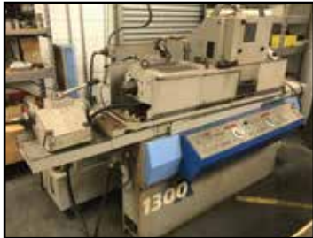
JONES & SHIPMAN 1300X CNC Grinder