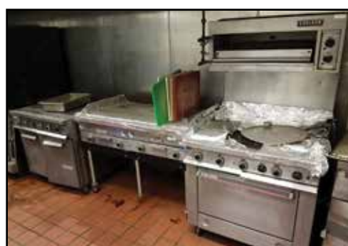
GARLAND Commercial Ranges