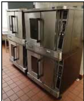
GARLAND Ranges & Convection Ovens