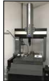
BROWN & SHARPE CMM