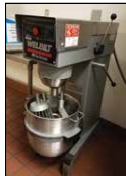
WELBILT & HOBART Mixers