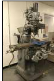
SHARPE 3-HP Mill