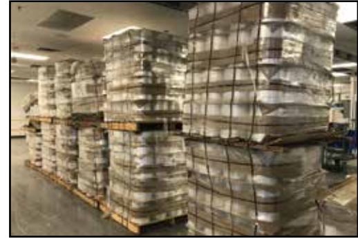
(15+) Skids of Plastic Wrap