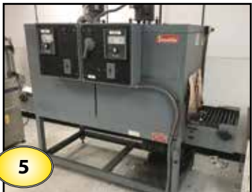
(5) PROPACK, BRONWAY & Other Heat Tunnels