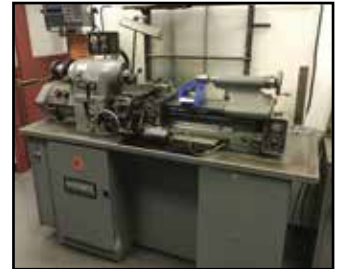
HARDINGE HLH-H Lathe