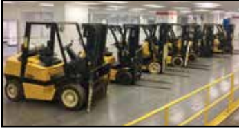
(29) Forklifts, New as 2012

INSPECTION: Day Prior to Auction from 9AM - 4PM