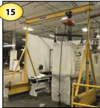
(15) 1-Ton Gantry Cranes