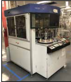
INTEGRAL VISION 990-0298