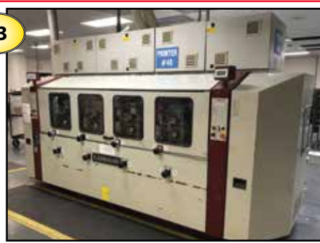
(13) KAMMANN 4-Color Screen Printers