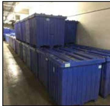
Material Handling Totes