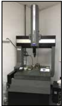
BROWN & SHARPE Micro Xcel CMM