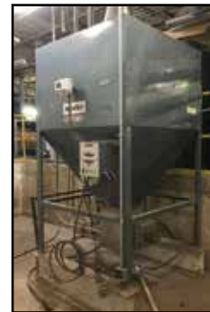
CONAIR Material Hopper