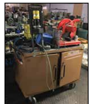
ENERPAC Hydraulic Crimping Station