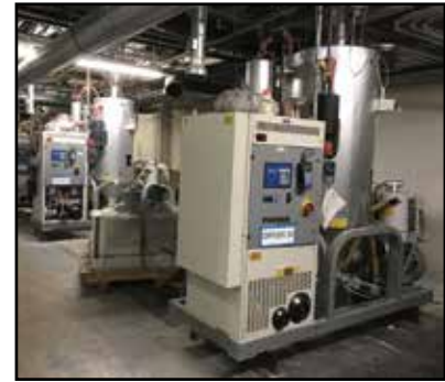
(3) PIOVAN DSN520ME Dryers