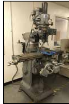
SHARPE 3-HP Mill