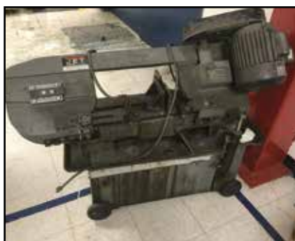
JET Horizontal Bandsaw