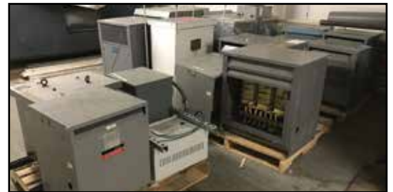
Electrical Takeouts - Transformers, Switches, Fuse Panels, Motors to 25-HP & More