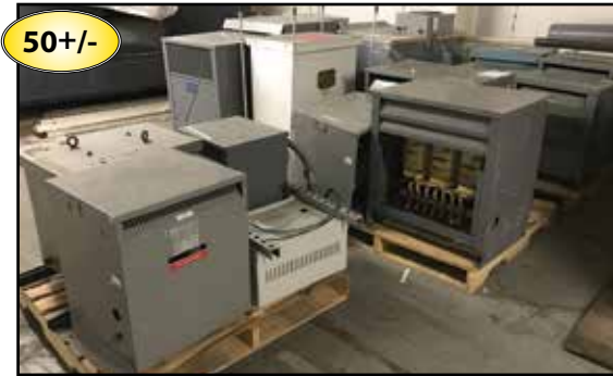
(50+/-) SQUARE D Transformers & Other Electrical Takeouts