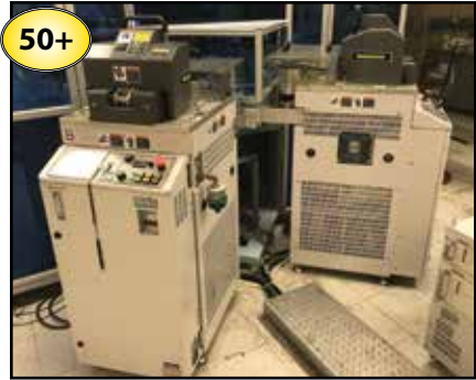
(50+) SIMULUS & MAXIS Metallizers