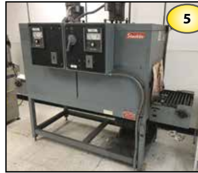
(5) PROPACK, BRONWAY & Other Heat Tunnels