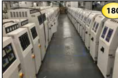
(180) SHIBAURA, SYSKO, MATSUI & Other Temperature Control Units