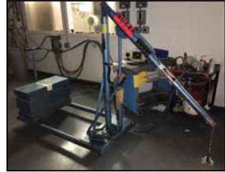
RUGER Hoist System