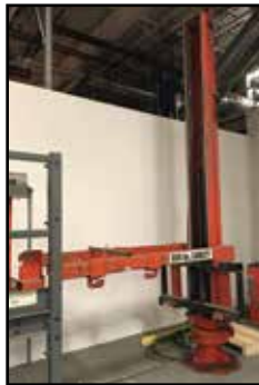
ALM 3,000-lb. Pallet Stacker