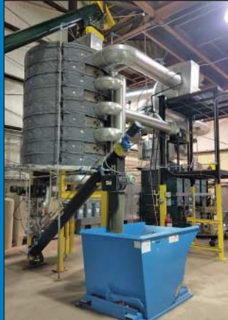
Custom Built Vertical Style Heated Wood Chip Curing Reactor System w/ RK Industries Reactor Insulated Side Walls