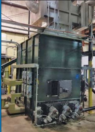
ARE Advanced Recycling Equipment Challenger CCUE402-A Warm Air Thermal Combustion System