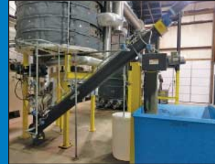
Very Clean Shakers, Hoppers, Auger Conveyors And Control Systems