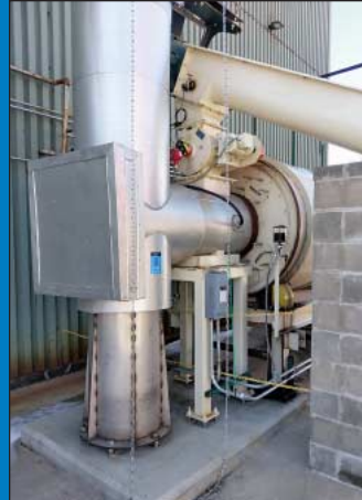
4' Dia. x 12' Long EcoTherm E-450x22 Three-Pass Rotary Drum Dryer w/ Metering Feed Hopper, Auger Conveyor