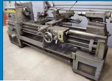
Lathes, Mills, Grinders, Drills & Conventional Machine Tools With Tooling & Accessories