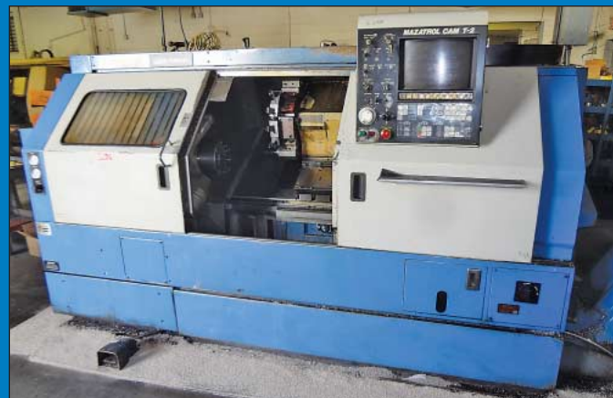
(2) Mazak Model QT-25 CNC Turning Centers

INSPECTION: Tuesday, September 22nd from 10:00 AM to 4:00 PM