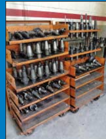
CNC Machining & Turning Centers By Mazak, Hitachi & Others & Large Quantity Tooling