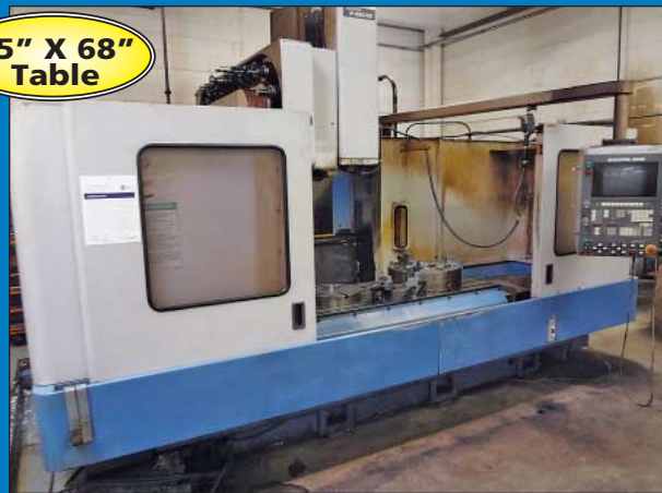
(2) Mazak Model MTV-655-60 CNC VMC's