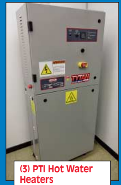
(3) PTI Hot Water Heaters