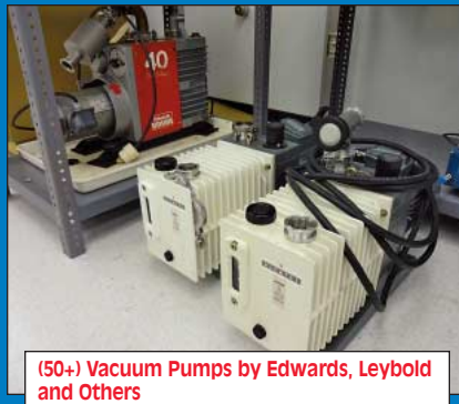
(50+) Vacuum Pumps by Edwards, Leybold and Others