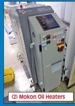
(2) Mokon Oil Heaters