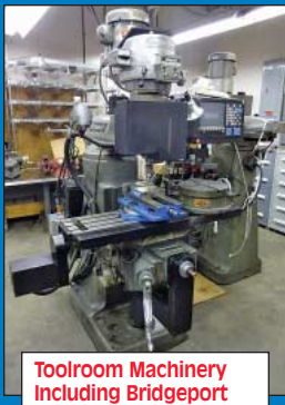
Toolroom Machinery Including Bridgeport