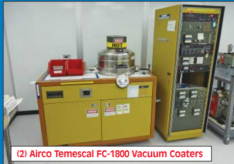
(2) Airco Temescal FC-1800 Vacuum Coaters