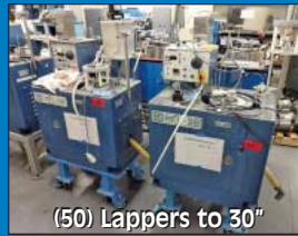
(50) Lappers to 30"