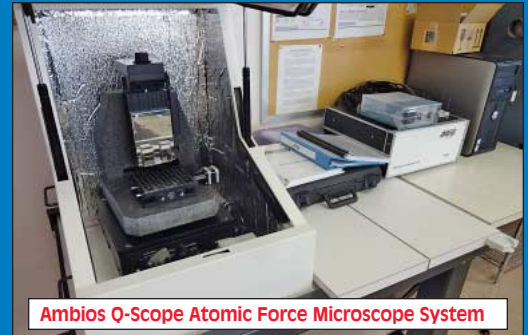
Ambios Q-Scope Atomic Force Microscope System