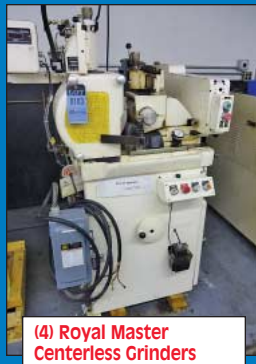
(4) Royal Master Centerless Grinders