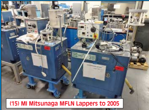
(15) MI Mitsunaga MFLN Lappers to 2005