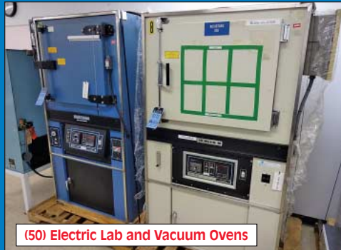
(50) Electric Lab and Vacuum Ovens