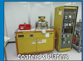
Coaters & Platers