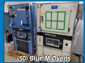
(50) Blue M Ovens