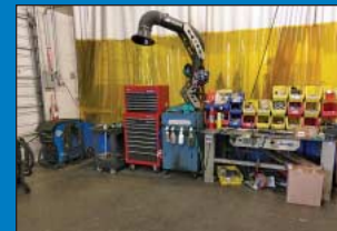
Partial View of Shop Equipment