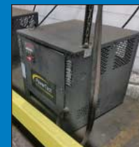
(4) Hawker / Powertec 24-Volt Battery Chargers