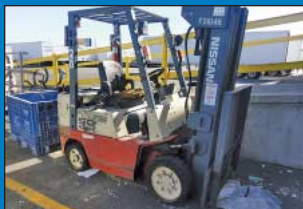
5,000 Lb. Nissan Optimum 50 LP Gas Cushion Tire Lift Truck