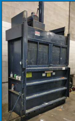
30" X 72" Cram-O-Lot Model DBR-72H Hydraulic Vertical Cardboard Baler