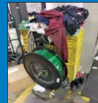
Signode Banding Carts