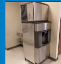
Manitowoc Ice Machine