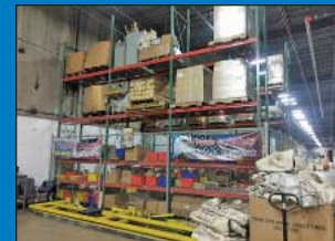
Tear Drop Style Pallet Racking

See website www.cia-auction.com For Detailed Specifications, Photos, Link To Online Bidding And Terms Of Sale. Possible Additions, See Auction Catalog for final list of available items.