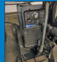
Miller B75 Spectrum Mig Welder