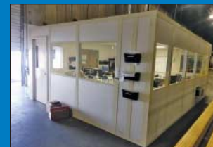
Approx. 14' x 20' Modular Office Structure