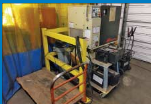
15 HP Ingersoll Rand Rotary Screw Type Tank Mounted Air Compressor