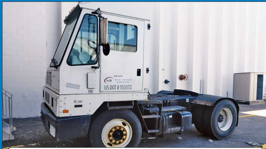
2004 Ottawa Model 30 Spotting / Yard Tractor

CINCINNATI INDUSTRIAL AUCTIONEERS auctioneers | appraisers | since 1961 | cia-auction.com | info@cia-auction.com 2020 Dunlap St., Cincinnati, Ohio 45214 Phone 513-241-9701 Fax 513-241-6760