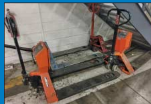
(2) 4,000 Lb. LTS Pallet Trucks w/ Digital Scales