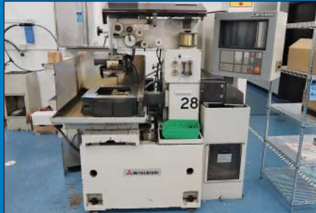
Mitsubishi Model DWC90CR CNC Wire EDM