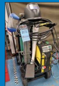
Esab Model 2200i Tig Welder