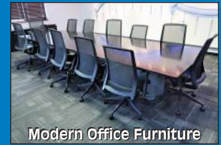
Modern Office Furniture