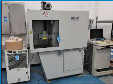
Control Laser Corp., Model Icon LS-900 Laser Engraver / Marking Machine