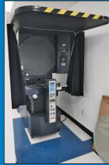
30" OGP Model QL-30 Optical Comparator w/ Dimetric Plus DRO