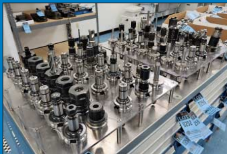
(200) Cat. 40 Toolholders & Misc. Tooling