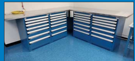
(10) Rousseau Tooling Cabinets