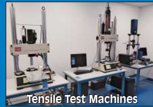
Tensile Test Machines