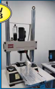
MTS Model 359 Axial Tension Test Machine