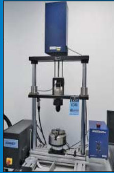
Admet Model eXpert 81T Axial Tension Test Machine w/ PC Control