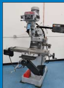
3 HP Seiki VS Two-Axis CNC Vertical Milling Machine

MTS Model 359 "858 Mini Bionix II" Axial Torsion Tensile Test Machine; S/N 10259378, Part # 100-191-185, 25 KN Force Capacity, MTS Model 622.20D-03 Axial Torsional Load Transducer; S/N 10256087, 10 KN Axial Capacity, 100 N-m Torsional Capacity, 4" Axial Stroke, 270 Degree Torsional Displacement, (New 2008)