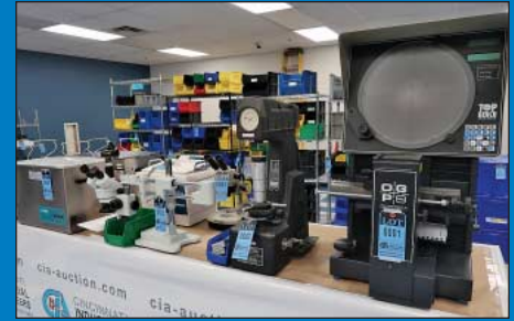
14" OGP Optical Comparer, Lab and Test Equipment

MTS Model 359 Axial Tension Test Machine; S/N 10259379, Part # 100-191-192, 25 KN Force Capacity, MTS Model 661.19F-04 Axial Torsional Load Transducer; S/N 341669, 25 KN Axial Capacity, 250 N-m Torsional Capacity, (New 2008)