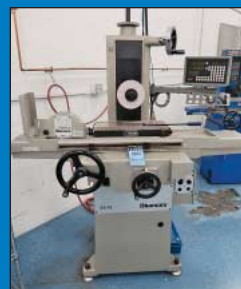
6" x 18" Okamoto Model E6-18 Hand Feed Surface Grinder