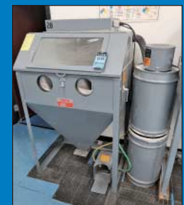
(2) Trinco Model 36BP Blast Cabinets