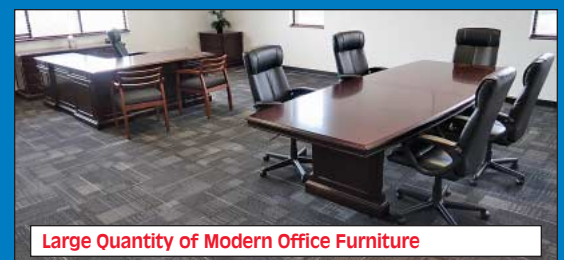
Large Quantity of Modern Office Furniture